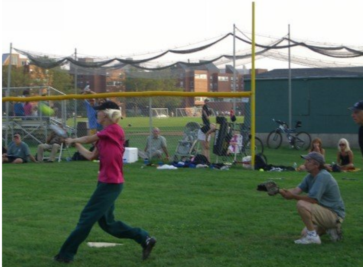
A game of slow pitch softball taking place in the outfield grass of MIT's baseball field

Summer softball at MIT will be in full swing soon. During the academic semesters, MIT offers students a multitude of intramural sports to participate in. During the summer, however, intramural sports take a break, leaving students a void of recreational team sports to keep active with. The MIT Community Summer Softball League (MITCSS) has helped fill this void for the past 40 years. Each summer, more than 40 teams sign up to participate in a competitive softball league with weekly games taking place on MIT's Briggs field. Participants range in MIT affiliation from undergraduate students, to alumni, to employees at Draper Laboratory.