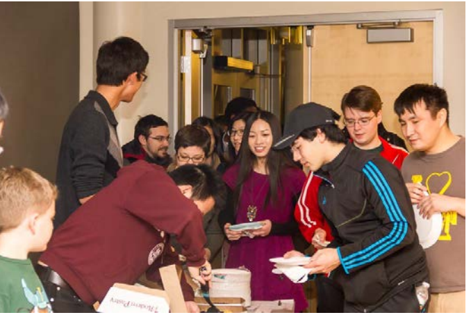
Ashdown Pi Day, March 14