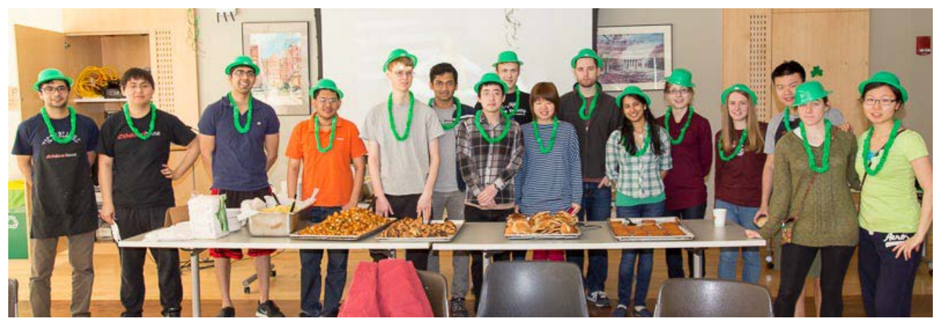
St. Patrick's Day Brunch, March 16