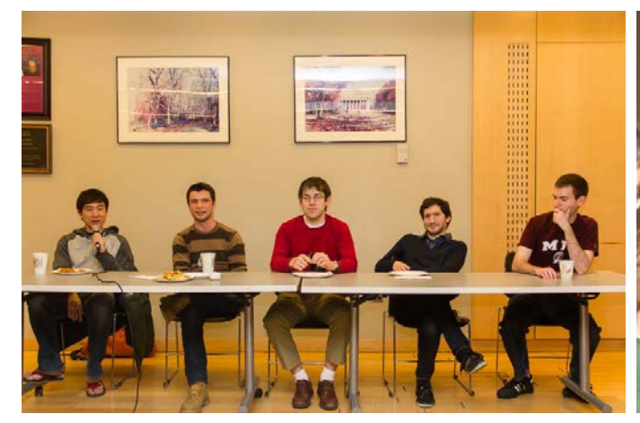
AHEC Nominee Speech Night, March 6