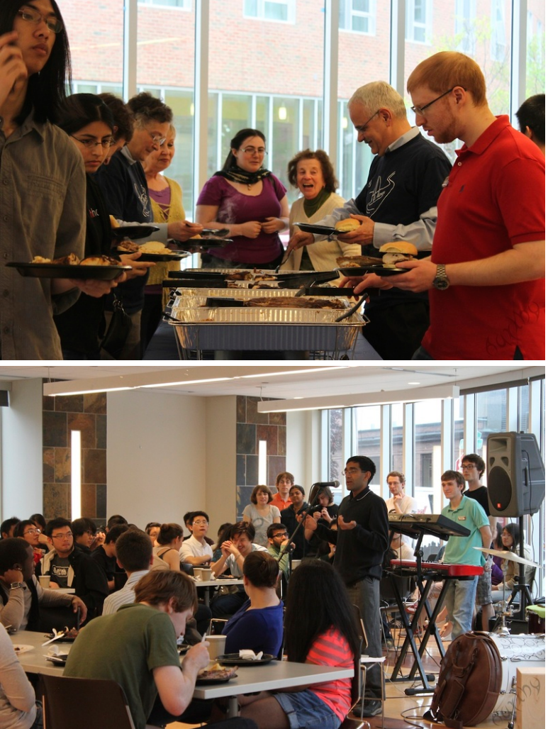
The Orlandos also received a giftbook, signed with messages from Ashdown's residents.