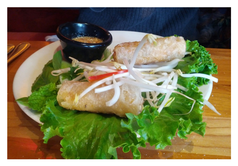
The Rouleaux. "It was piping hot, crispy, and stuffed with deliciousness."

We both got the Nyuom Trasak with Soba Noodles as our second course, mine with chicken, his vegan. While I found the food itself to be delicious, it was way too hot for me. This is not the restaurant's fault - it is advertised as having a "spicy chili-lime tuk trey" dressing, but be aware that this is indeed pretty spicy. I can handle a little bit of spice (I'm a red curry on the scale of massaman to green curry), but this was just a little too much for me. My companion said that his was just fine and delicious, though, so he probably has a better handle on spiciness than me =) The cool temperature felt good though on a summer night.