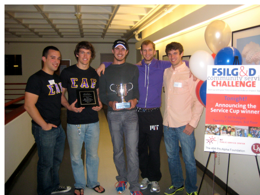
Service Cup Winners