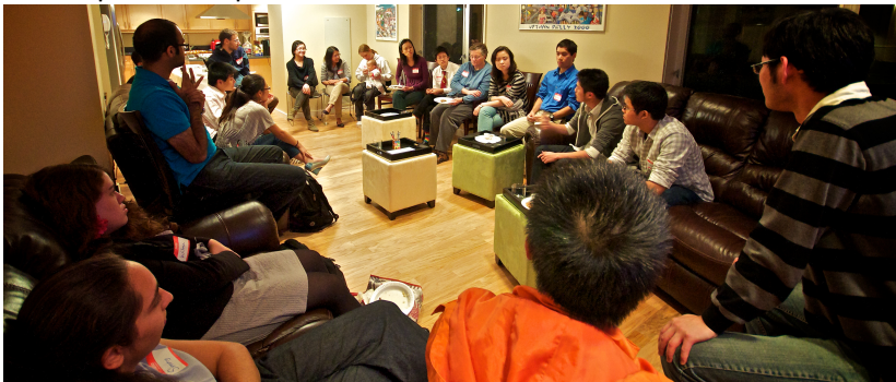
Ashdown Housemaster Special Discussion 1 – Overseas Students and Migrant Workers, Oct. 12 th

For example, in the second discussion about entrepreneurship in China, we discussed three themes - Entrepreneurship Opportunities, Foreign and State-owned Firms, and Social Enterprises. Thirty participants were divided into three groups, each focusing on one of the themes. In the Entrepreneurship Opportunities group, we compared the popular companies in China and their counterparts in the US such as Facebook and Renren. Firstly, we analyzed the reasons why these Chinese start-ups have limited original innovation and have been adopting a 'technology following' strategy. We then looked at the possibility of a transition of China from the world factory to the owner of world-class brands. In the Foreign and State-owned Firms group, we listed the advantages and disadvantages of foreign companies versus state-owned companies in China. We debated over whether government intervention can always make the market-oriented economy more efficient. We also conceived an innovation path of Chinese companies and discussed how favorable policies and academic excellence can nurture the development of entrepreneurship in China.