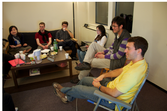
Discussion at Edgerton Student Dorm - Impacts of Social Media, March 6 th