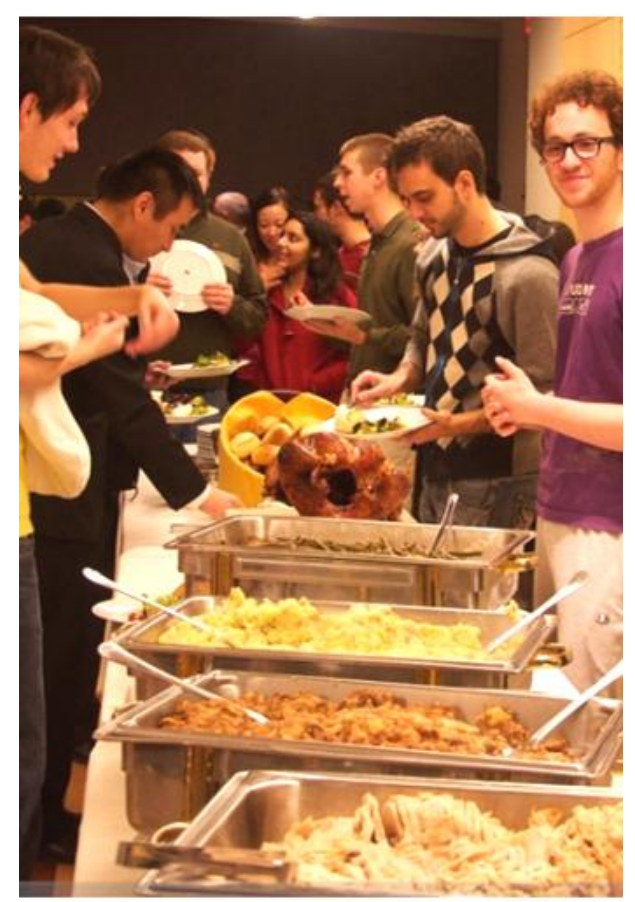
A glorious spread.

All photographs in this article are courtesy of Ganeshapillai Gartheeban.