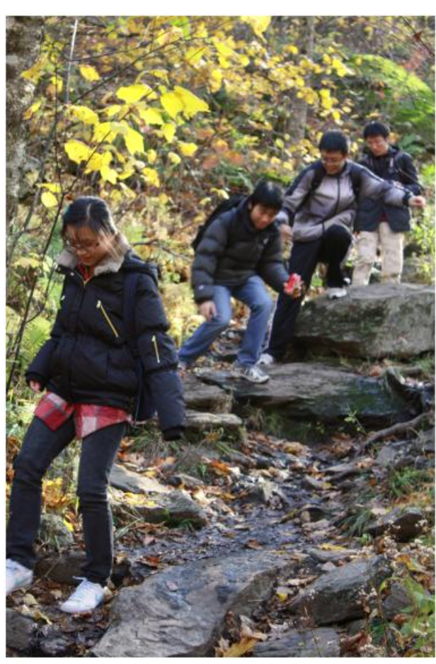
The descent (photograph courtesy of David Chhan).