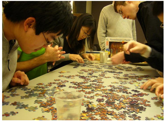
Brainwork and teamwork.

Each team was given a 300-piece jigsaw puzzle to complete. It was fascinating to watch the variety jigsaw puzzle-solving teamwork tactics employed as each team scrambled to be the first to assemble its pieces. For instance, some teams worked on the entire puzzle together, while others split the team into two to work on the borders and center of the jigsaw puzzle separately.