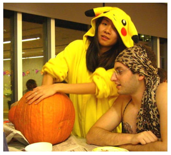
Pokémon encounters the joy of eviscerating a pumpkin

Participants were required to register online in advance but thanks to the surplus of pumpkins, attendees of the Coffee Hour were allowed to join the contest on impulse. Each group was given a pumpkin-carving kit, which included implements to hollow out and carve the pumpkin as well as a booklet of design templates. The majority of contestants were in groups of two to five, but some chose to carve alone.