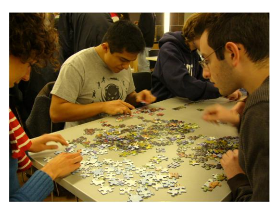
My Vu's team pulling ahead of the others.

Each team was given a 300-piece jigsaw puzzle to complete. It was fascinating to watch the variety jigsaw puzzle-solving teamwork tactics employed as each team scrambled to be the first to assemble its pieces. For instance, some teams worked on the entire puzzle together, while others split the team into two to work on the borders and center of the jigsaw puzzle separately.