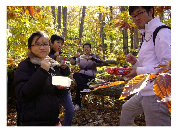
Lunch amid the fiery-colored foliage

Wachusett Mountain's modest height of 2,006 feet may make it seem an unchallenging venue for hiking; indeed, most of us had gained the windswept summit by noon and were proceeding to surfeit our gazes and our photography equipment with the panoramic view. Nevertheless, a full-day's hike upon the rugged trails would easily prove a trial of physical endurance for anyone.