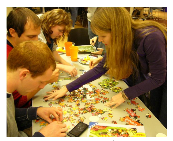
The heat intensifies.