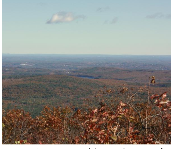
Mountaintop panorama.