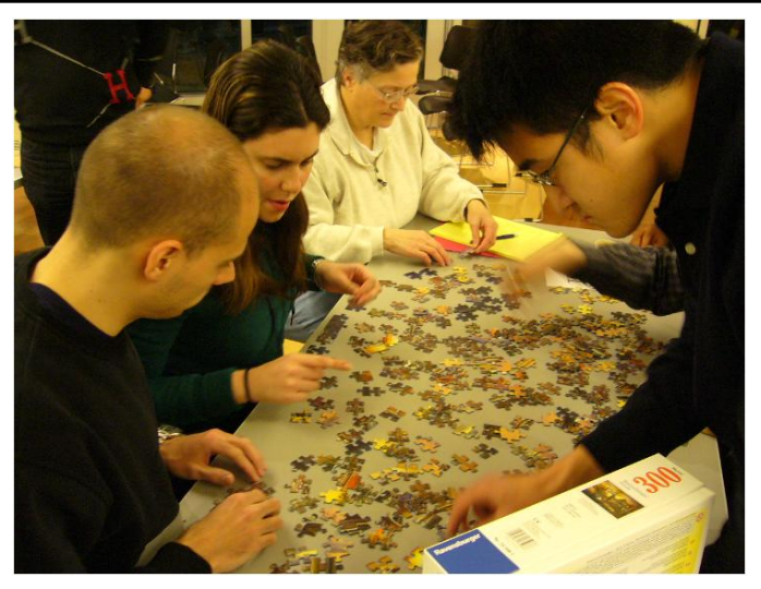
The race is on.

As the semester neared its end and stomachs tensed throughout Ashdown House in the face of encroaching deadlines and impending exams, the Ashdown House Coffee Hour Committee decided that it was once again time to counteract the mind-boggling mysteries of schoolwork and research with a more wholesome kind of conundrum: jigsaw puzzles! Approximately 60 people turned up for the event, which had about 20 participants divided into four contending teams.