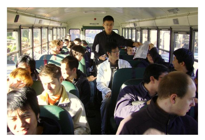
Preparing to set off.

Dismissing the urge to sleep in on a Saturday morning, forty Ashdowners and their guests set off from Ashdown House at 9 a.m. to witness the autumnal splendor of Wachusett Mountain. The event was organized by the Ashdown Outing Committee and fully subsidized for all residents of Ashdown House.