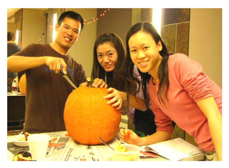
Pumpkin-carvers eager to begin

In the spirit of Halloween, the Coffee Hour Committee held a pumpkin-carving contest. The hour-long event drew almost a hundred people and produced over fifteen carved pumpkins.